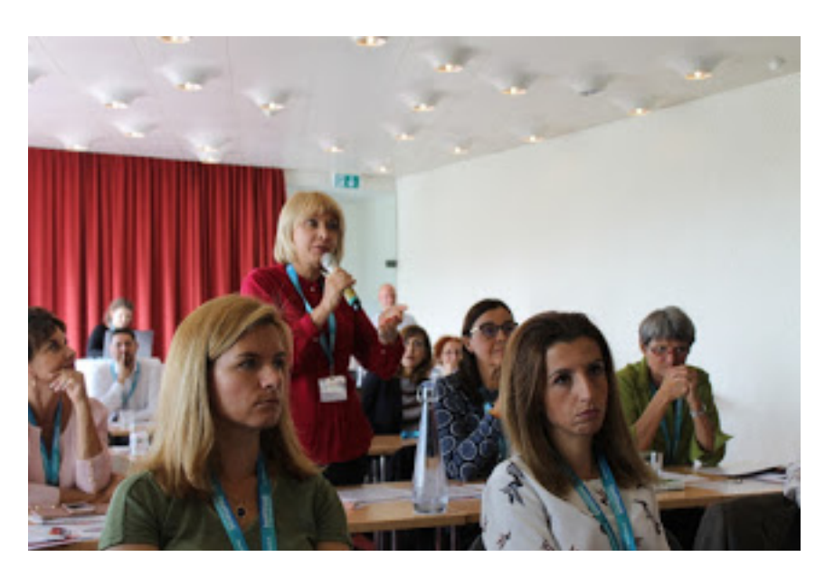
Posted by Syed Shoeb Ahmad

patients with a normal macrovascular endothelial function. The reduction in venous flicker-induced dilatation compared to dilatation in healthy individuals was associated with echographic evidence of left ventricular stiffness and pulmonary hypertension. An important cardiovascular risk factor, hypercholesterolemia, was also associated with a significant reduction of flicker-stimulated arteriolar dilatation. According to Nägele, retinal vascular analysis may be a useful tool for cardiologists to assess the success of vascular-targeted therapies in patients with heart failure.